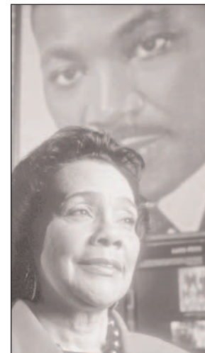
Coretta Scott King

Coretta Scott King served as a co-chair of the Washington, DC Martin Luther King, Jr. National Memorial Project Foundation, Inc. leading a host of great Americans in raising the awareness and much-needed resources to construct a national memorial to pay tribute to the life and legacy of her husband. Although she has been gone just a short time, she is deeply missed and her memory and dedication of spirit will continue to guide us to success in this effort.