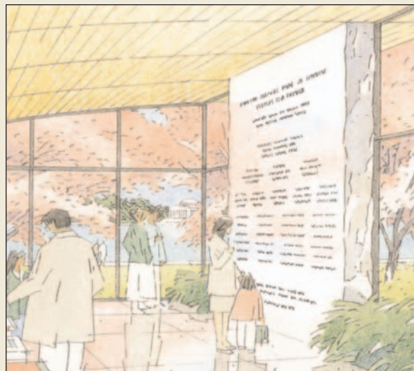
Martin Luther King, Jr. National Memorial Project Visitor Information Center

The Foundation is working with the National Park Service to define the requirements for a Visitor Information Center. This is great news because it will include the Donor’s Wall to recognize our high level ($500,000 and above) donors. The name will be placed on the Donor Wall according to their level of giving.