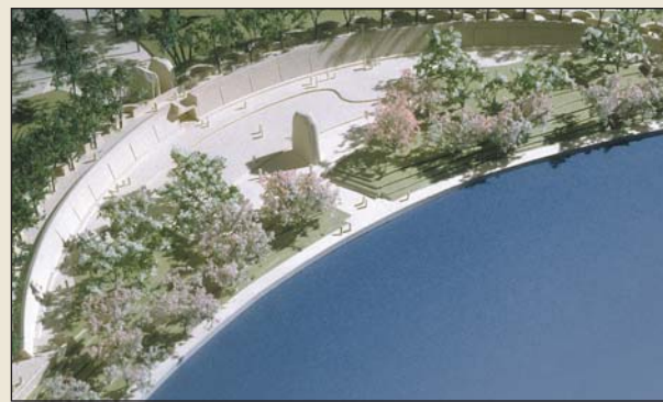
Memorial Site Model

All financial contributions to the Memorial Project are tax deductible. You can help Build the Dream by donating on our Web site at www.buildthedream.org or by calling toll-free 1.888.484.3373.