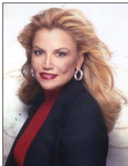
Suzanne de Passe Chairman and CEO de Passe Entertainment

The principal ambassadors of the “ Build the Dream ” campaign are the Executive Leadership Cabinet (ELC) members, whose main goal is cultivation and solicitation of major corporate gifts. In addition to raising or giving $1 million to the Memorial Project, the ELC will assist in identifying prospective donors, as well as facilitating the recruitment of other ELC members.