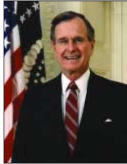
George H.W. Bush, 41st US President