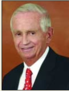
The J. Willard and Alice S. Marriott Foundation

Franklin Raines, Chairman and CEO of Fannie Mae and J. Willard Marriott, Jr., Chairman and CEO of Marriott International, Inc.